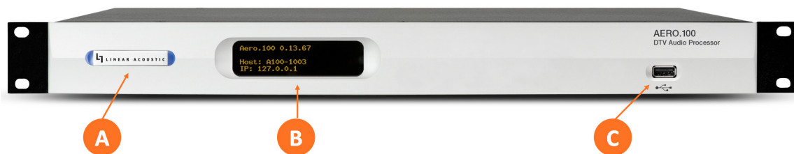
Figure 1: Front panel